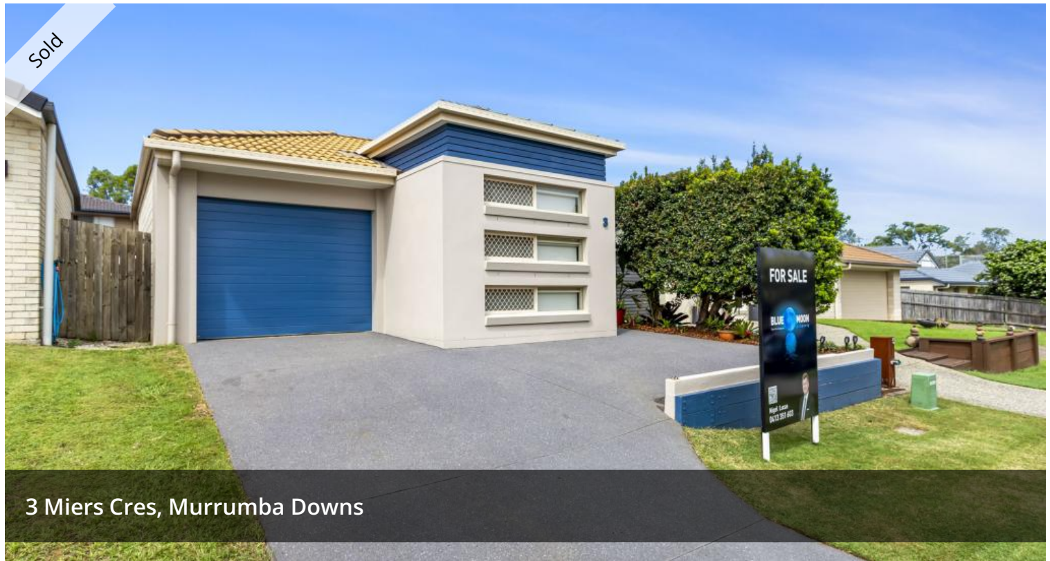
3 Miers Cres, Murrumba Downs