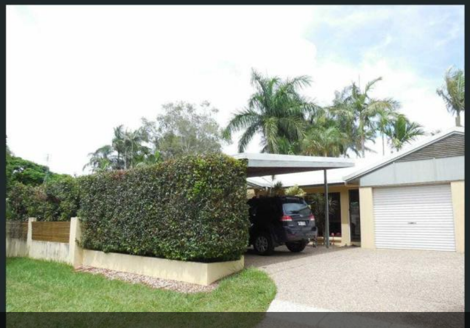
Unit 2, 1 Namba St, Pacific Paradise