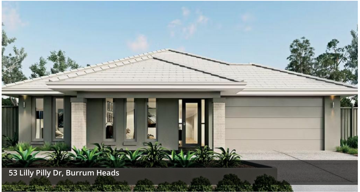
53 Lilly Pilly Dr, Burrum Heads