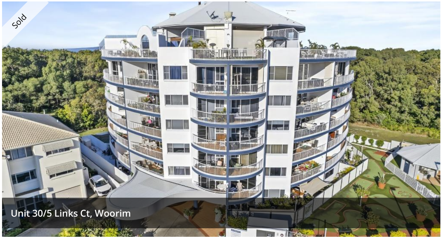
Unit 30/5 Links Ct, Woorim