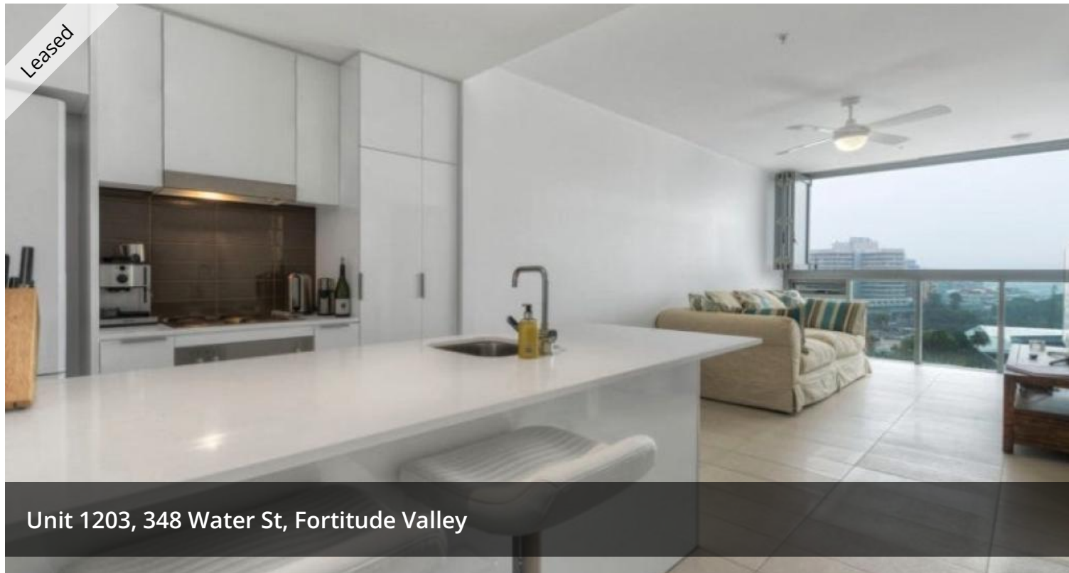
Unit 1203, 348 Water St, Fortitude Valley