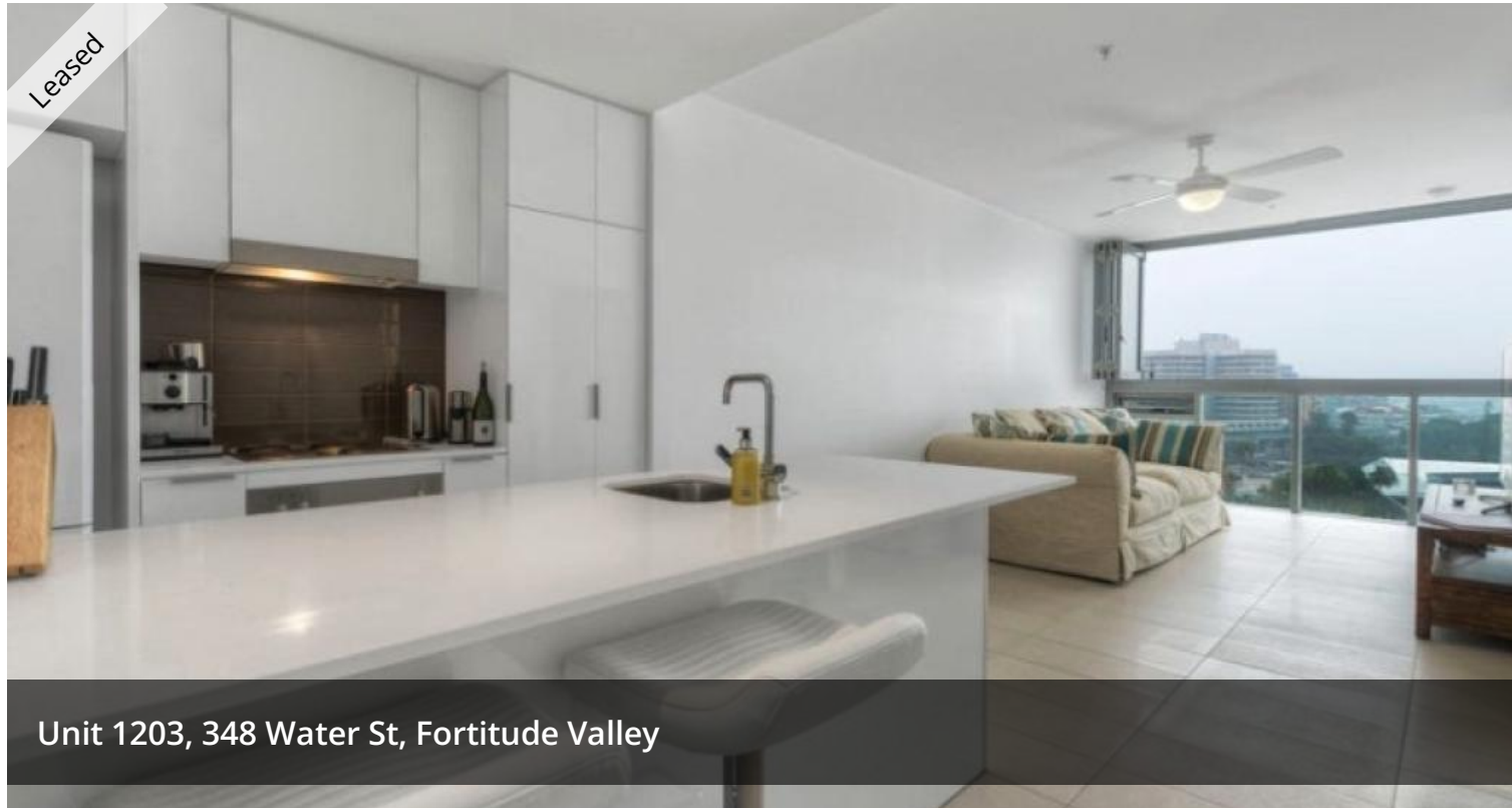
Unit 1203, 348 Water St, Fortitude Valley