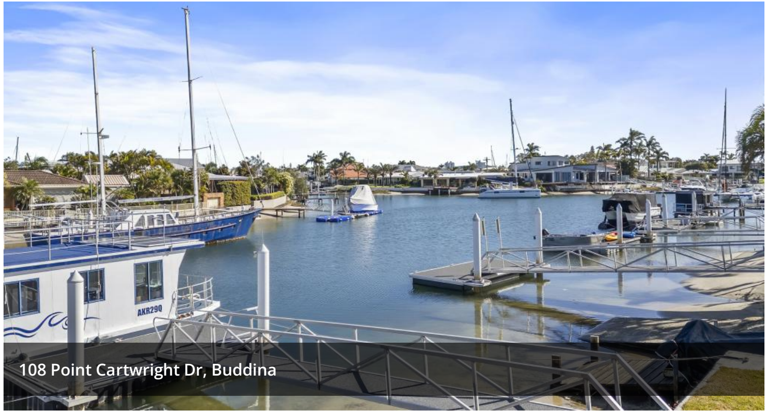
108 Point Cartwright Dr, Buddina