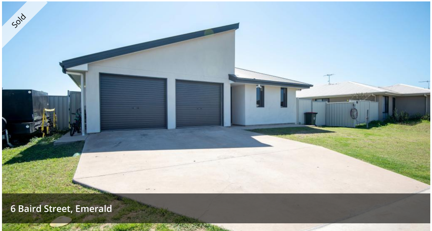
6 Baird Street, Emerald