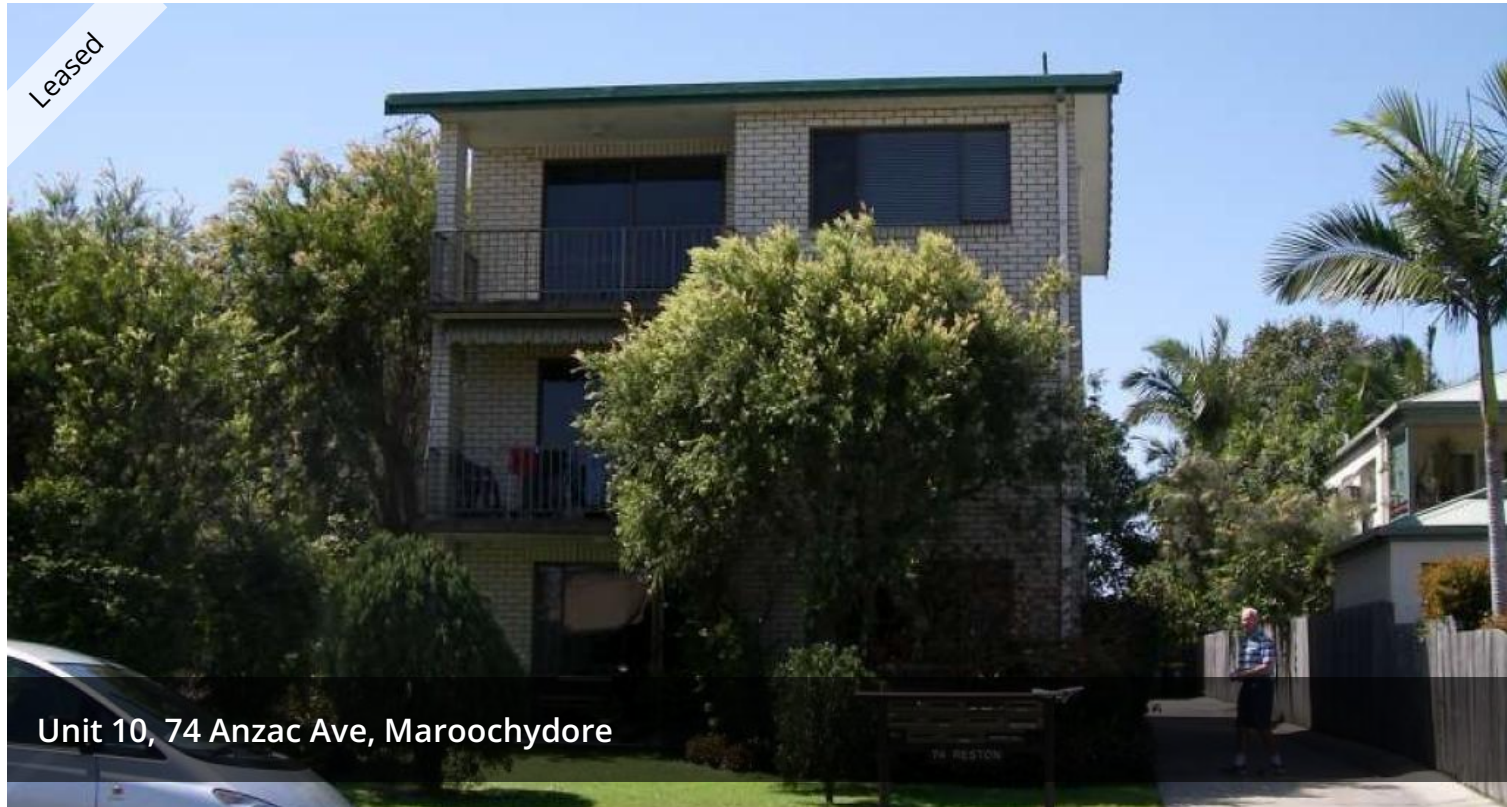
Unit 10, 74 Anzac Ave, Maroochydore