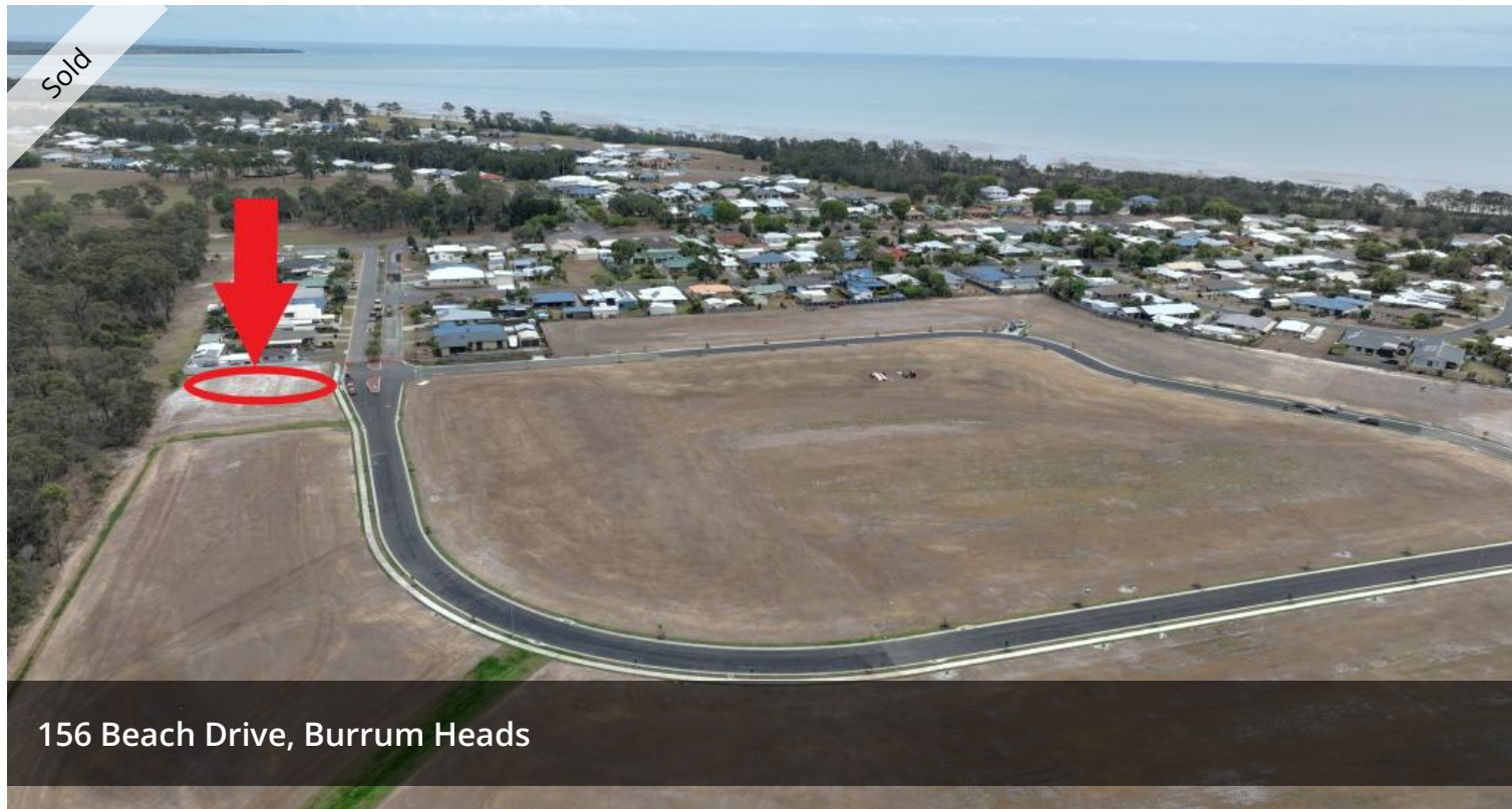
156 Beach Drive, Burrum Heads