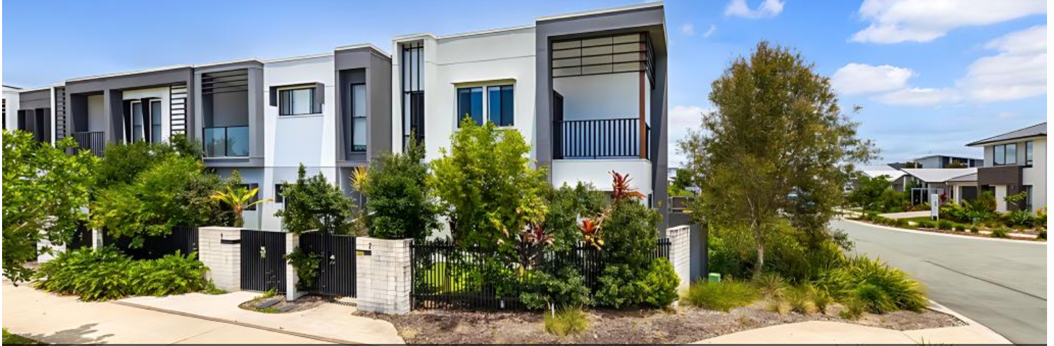
2 Parkway Tce, Palmview