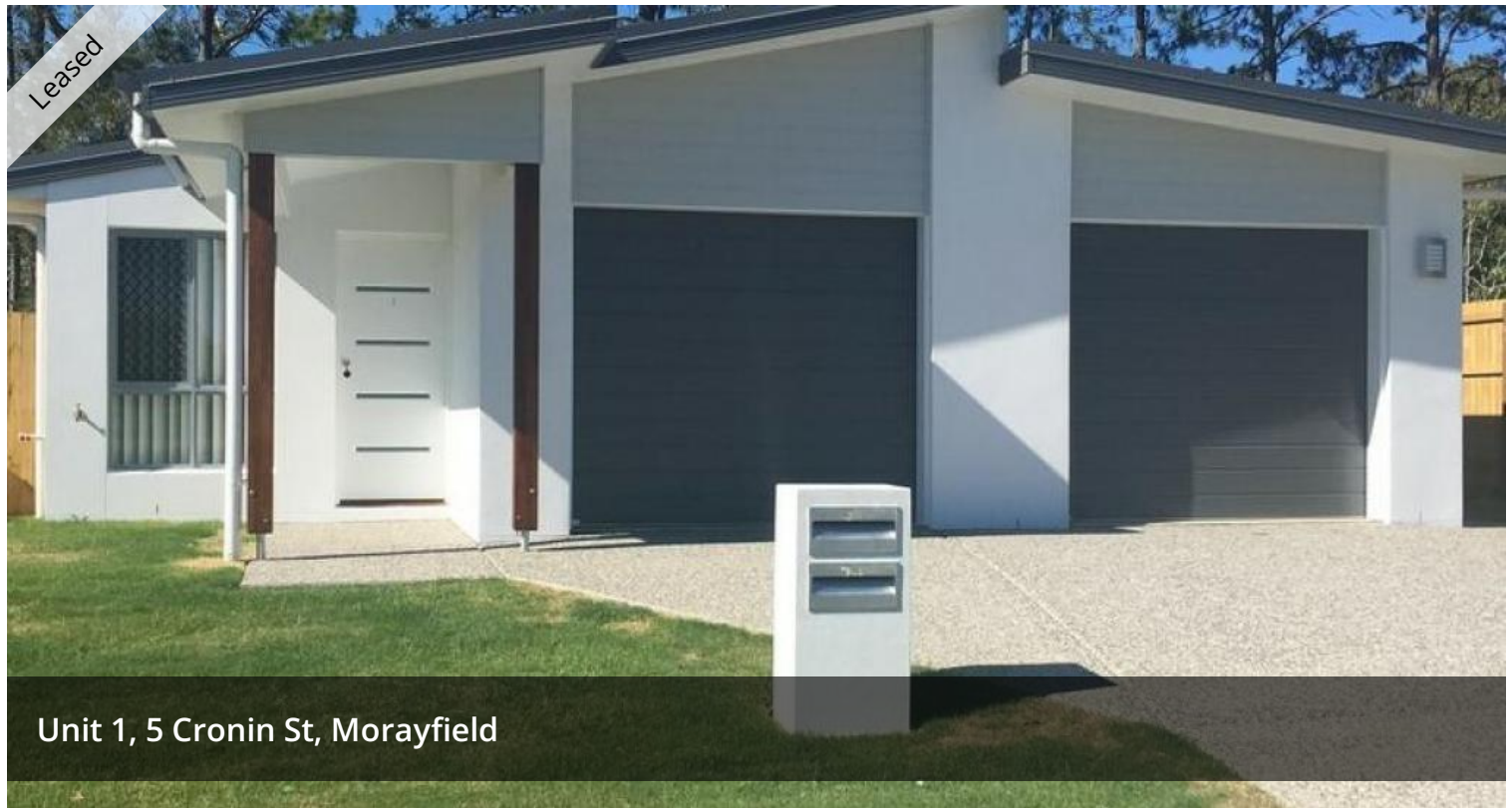
Unit 1, 5 Cronin St, Morayfield