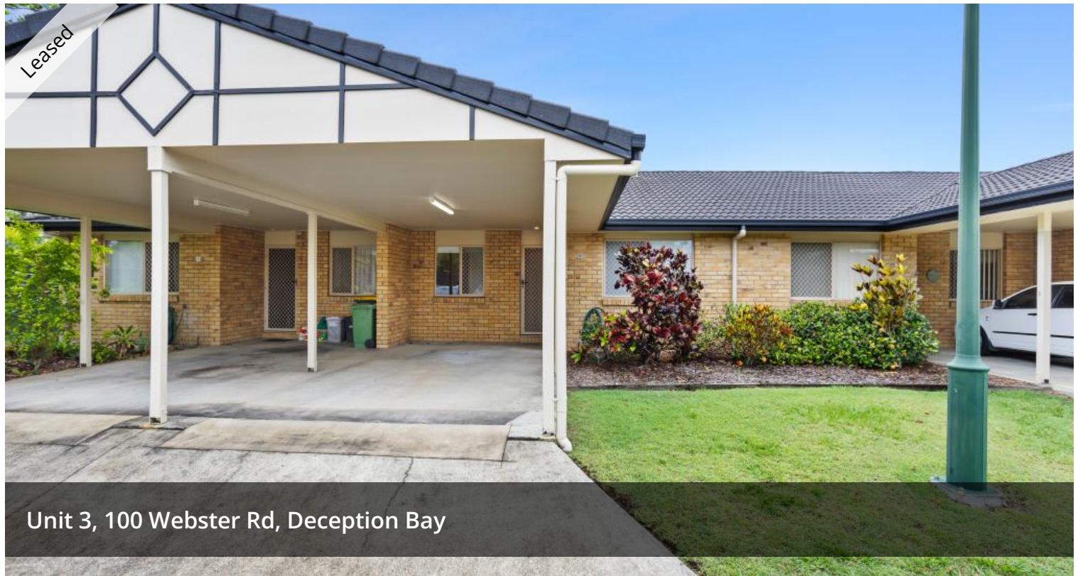
Unit 3, 100 Webster Rd, Deception Bay