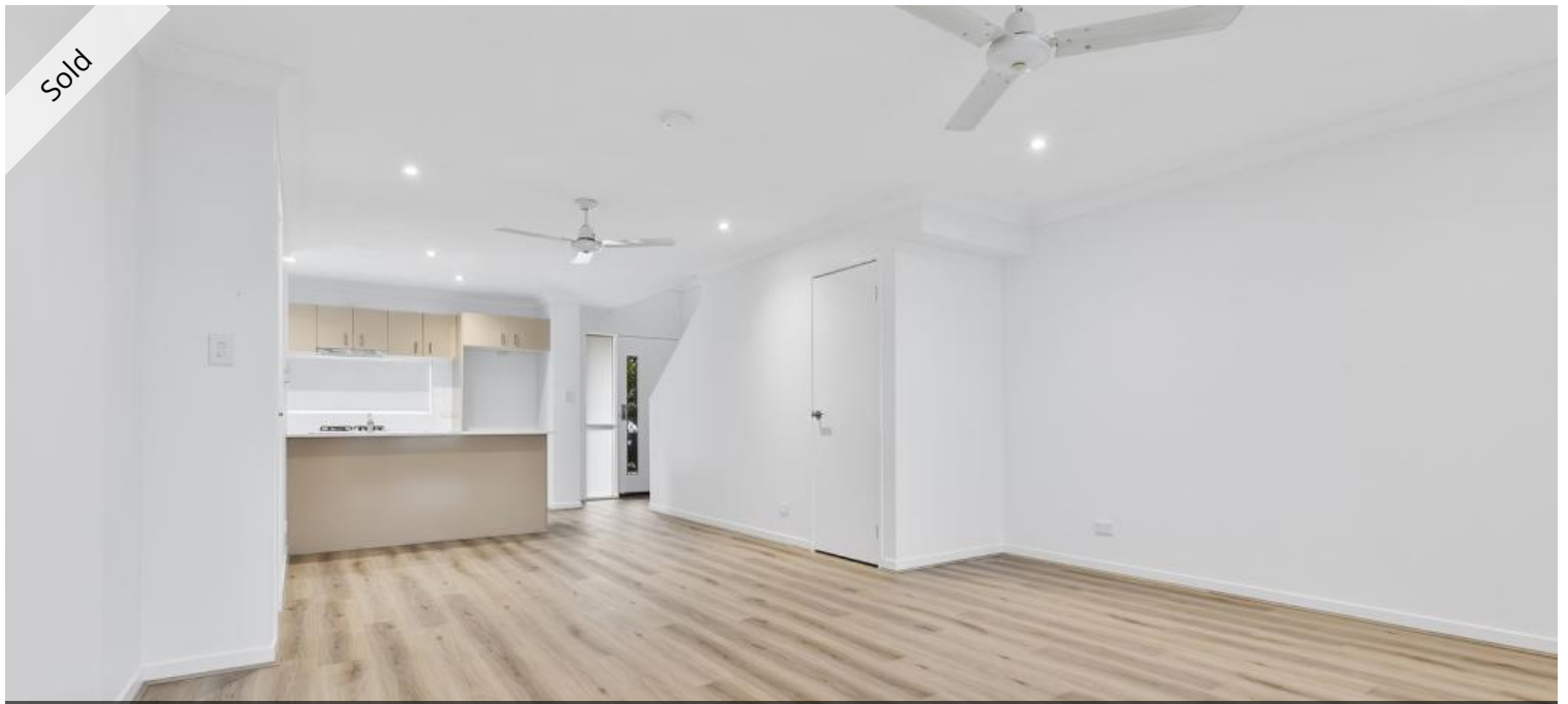
Unit 21, 1-49 Lavender Dr, Griffin