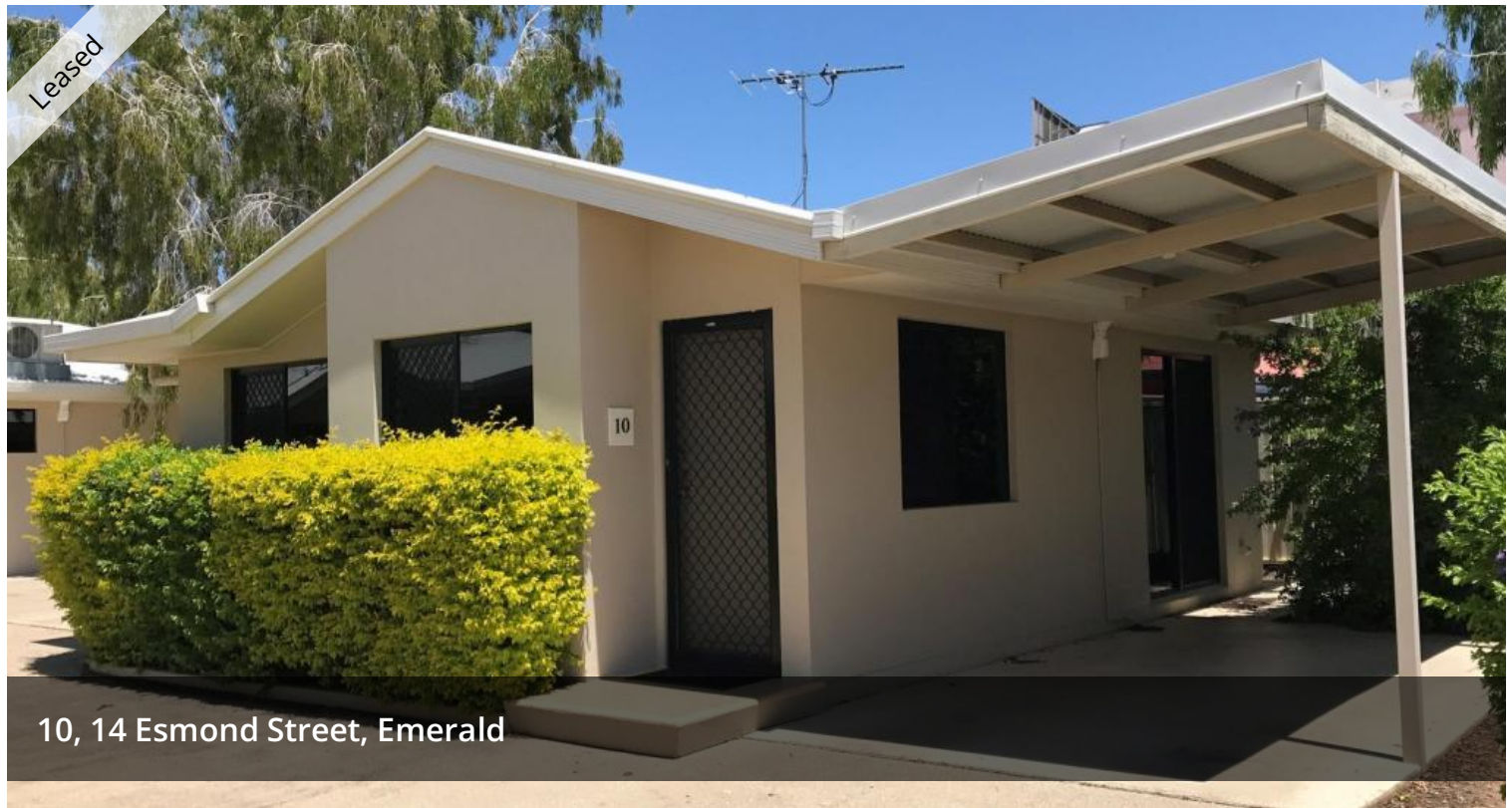
10, 14 Esmond Street, Emerald