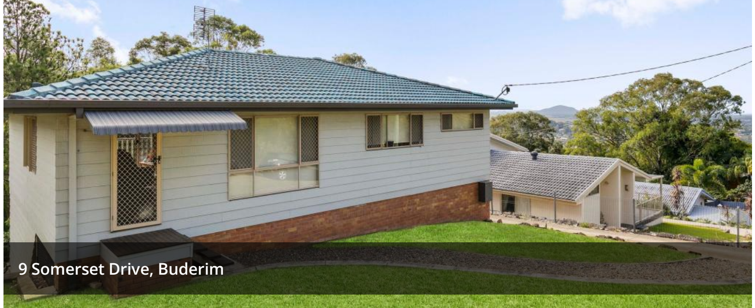
9 Somerset Drive, Buderim