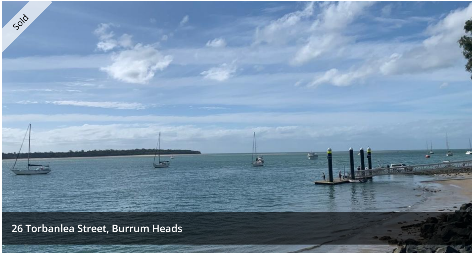
26 Torbanlea Street, Burrum Heads