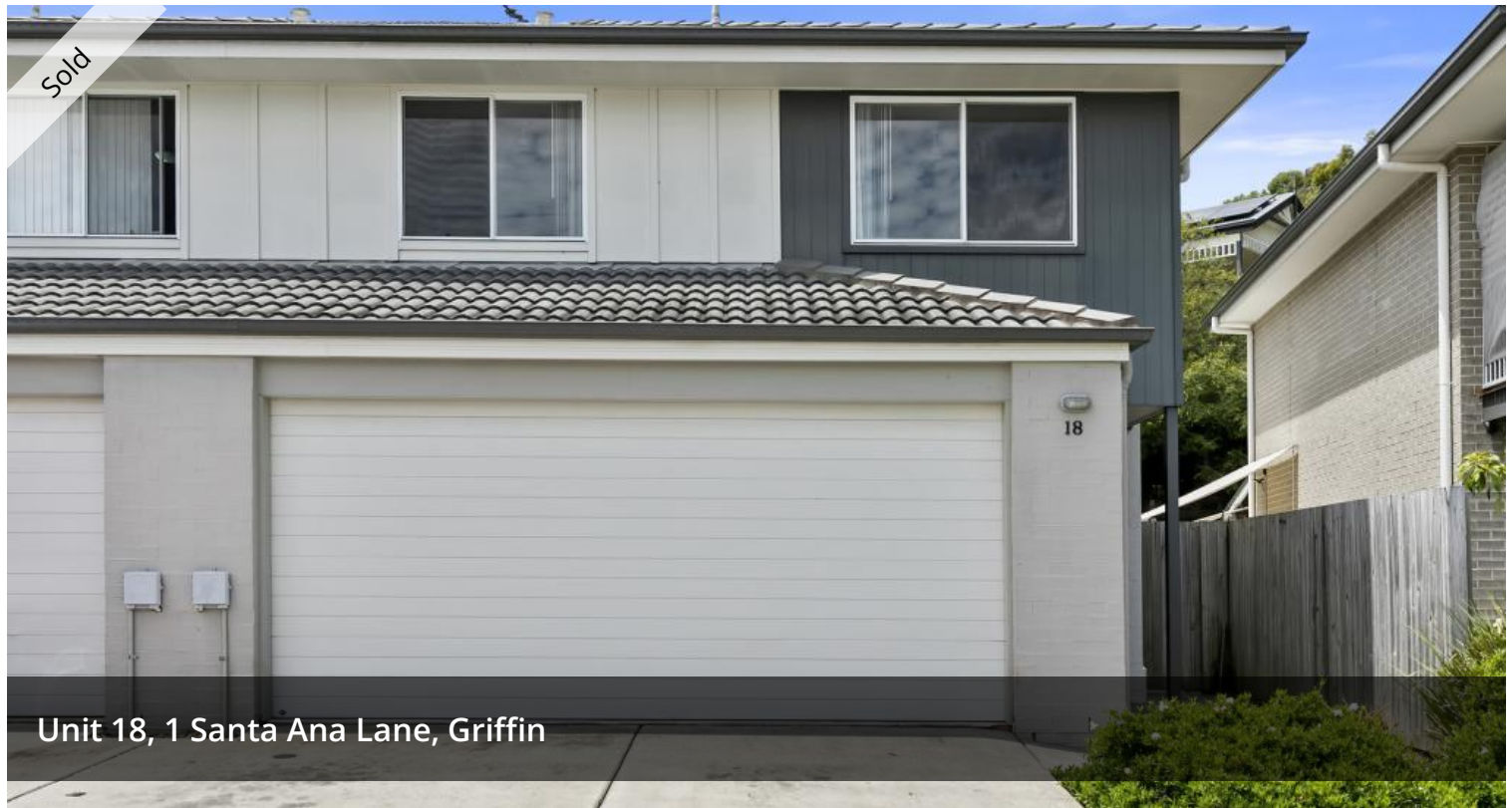
Unit 18, 1 Santa Ana Lane, Griffin