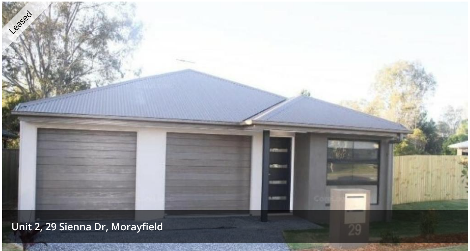
Unit 2, 29 Sienna Dr, Morayfield