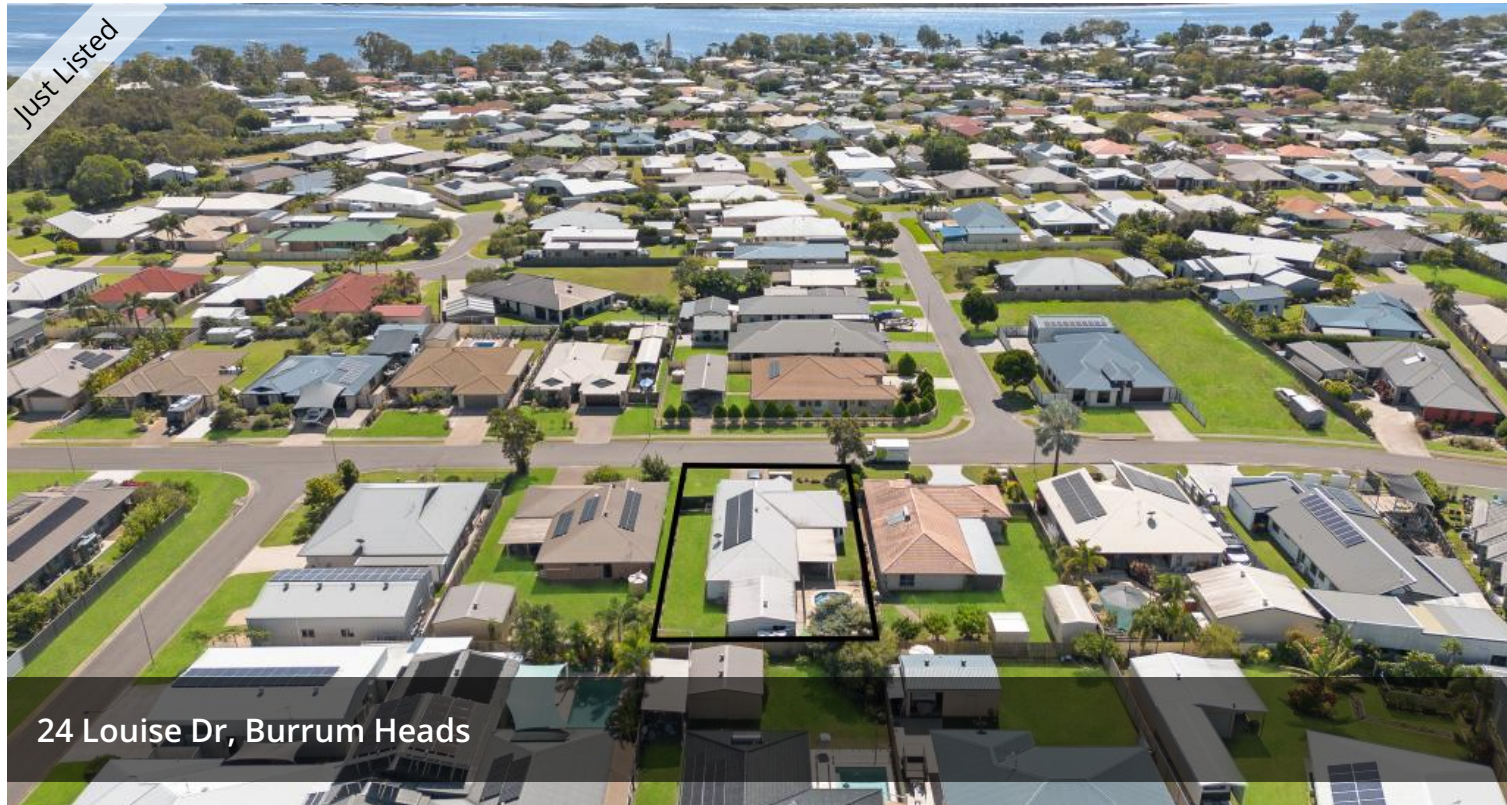
24 Louise Dr, Burrum Heads