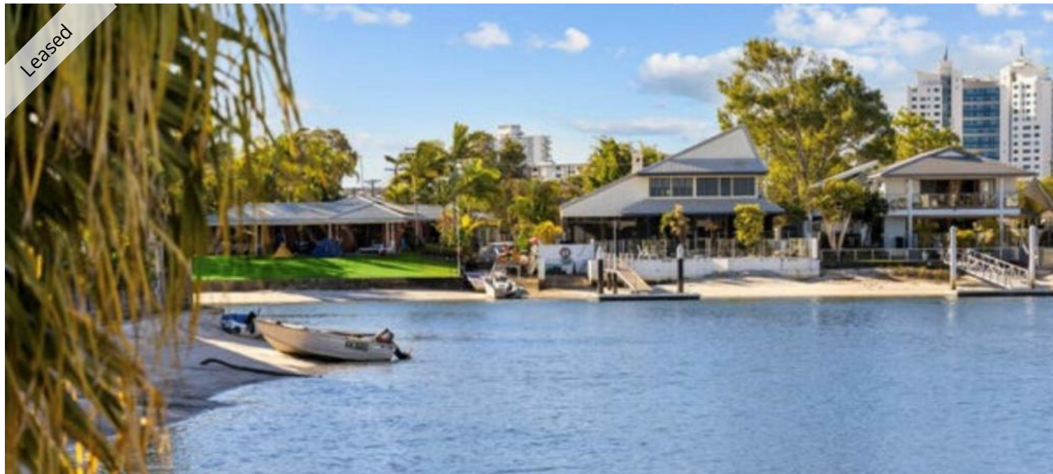
Unit 1, 10 Woomba Pl, Mooloolaba