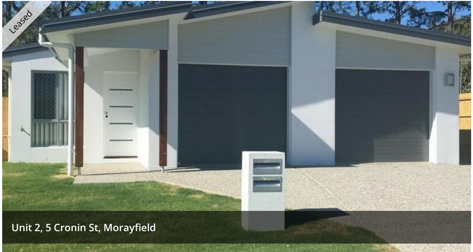
Unit 2, 5 Cronin St, Morayfield