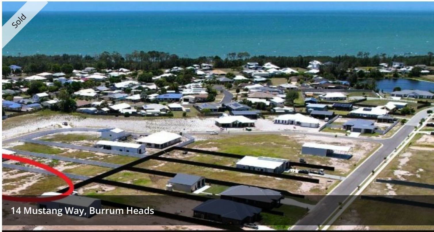
14 Mustang Way, Burrum Heads