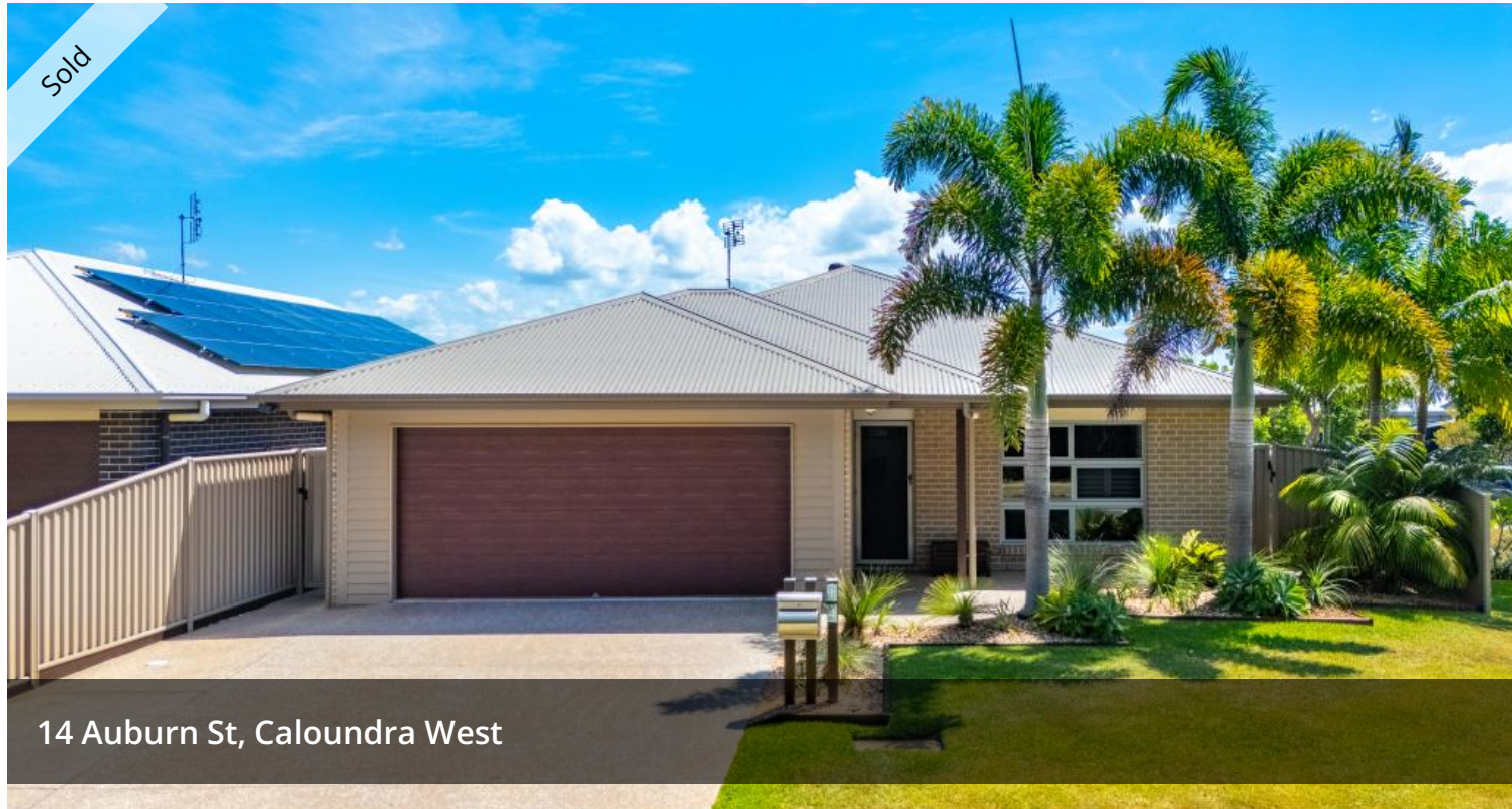
14 Auburn St, Caloundra West