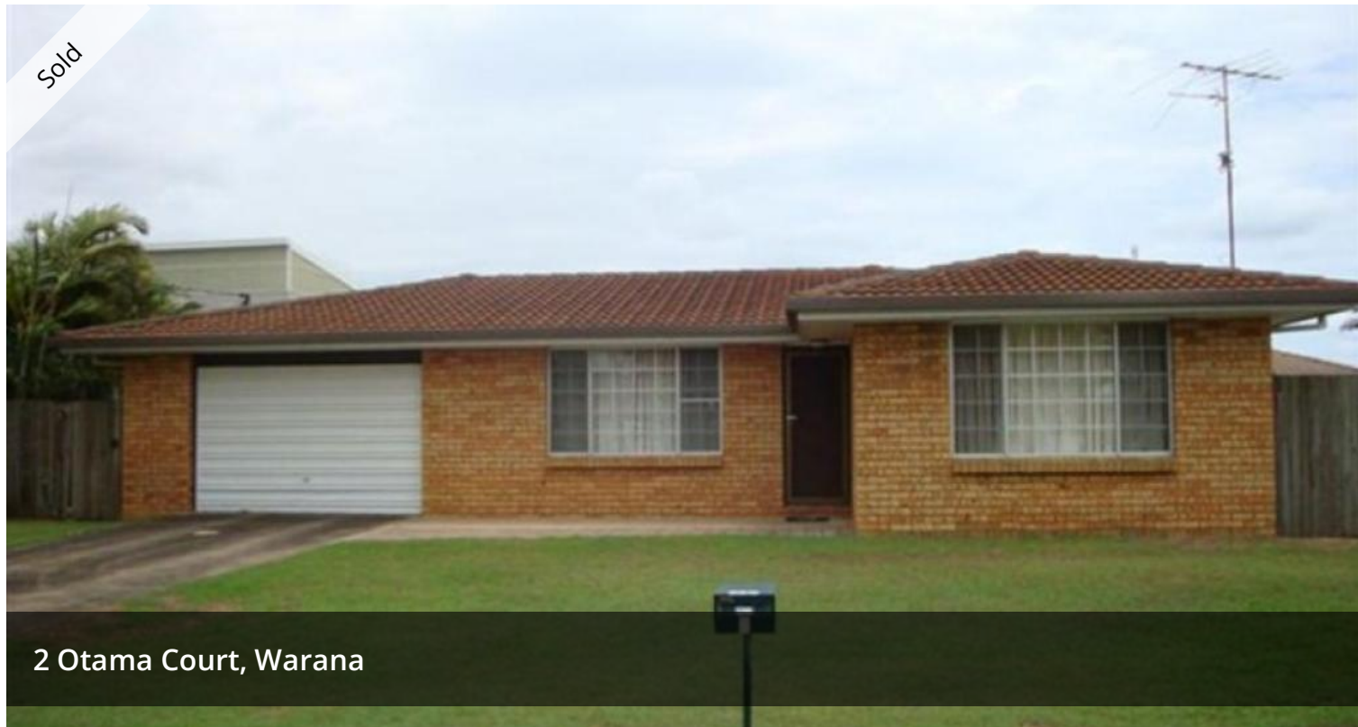
2 Otama Court, Warana