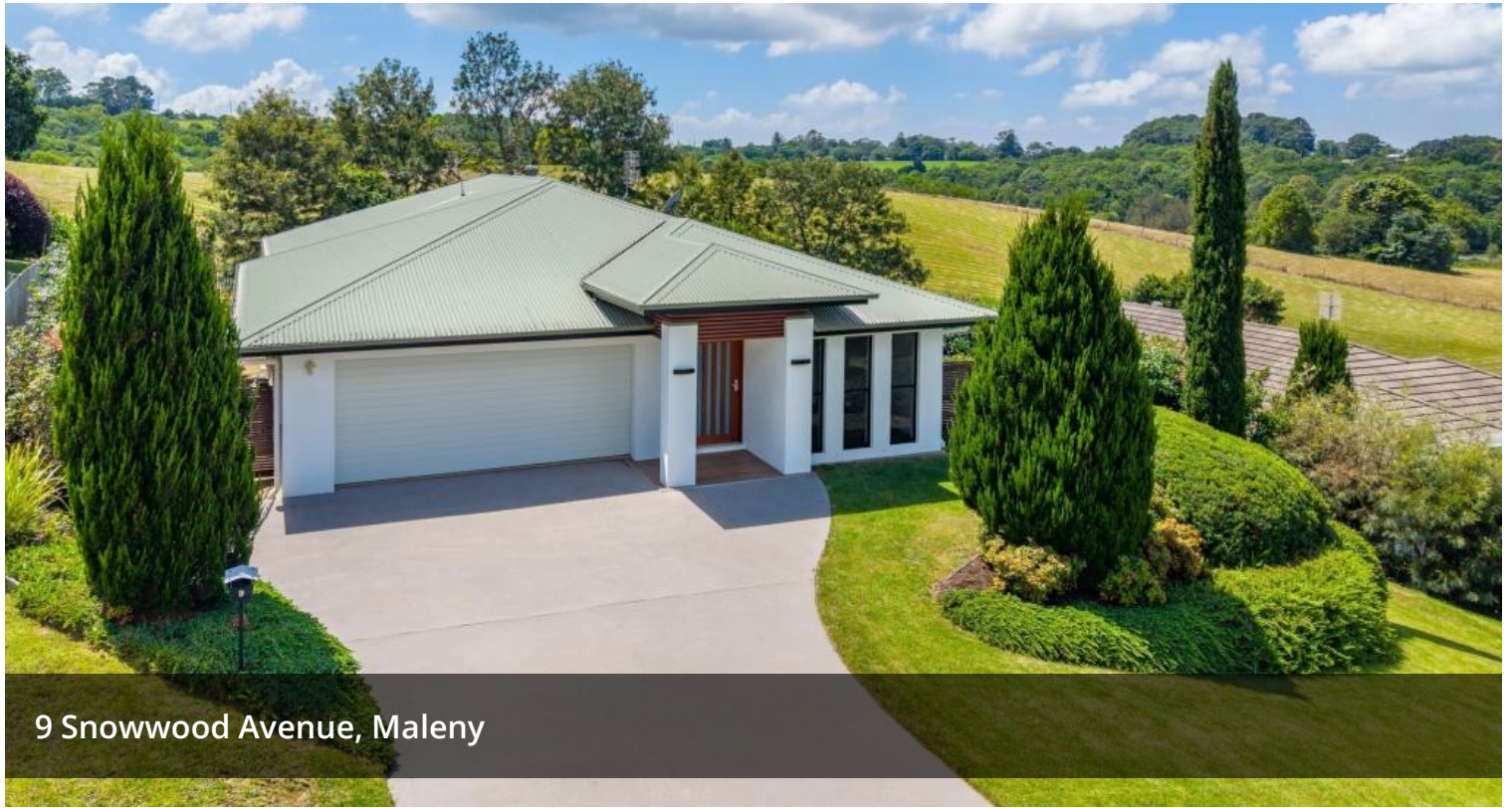
9 Snowwood Avenue, Maleny