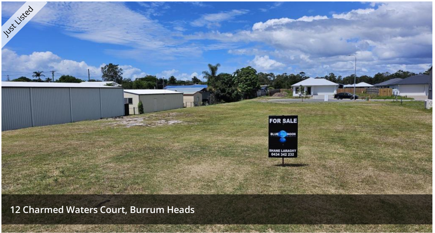
12 Charmed Waters Court, Burrum Heads