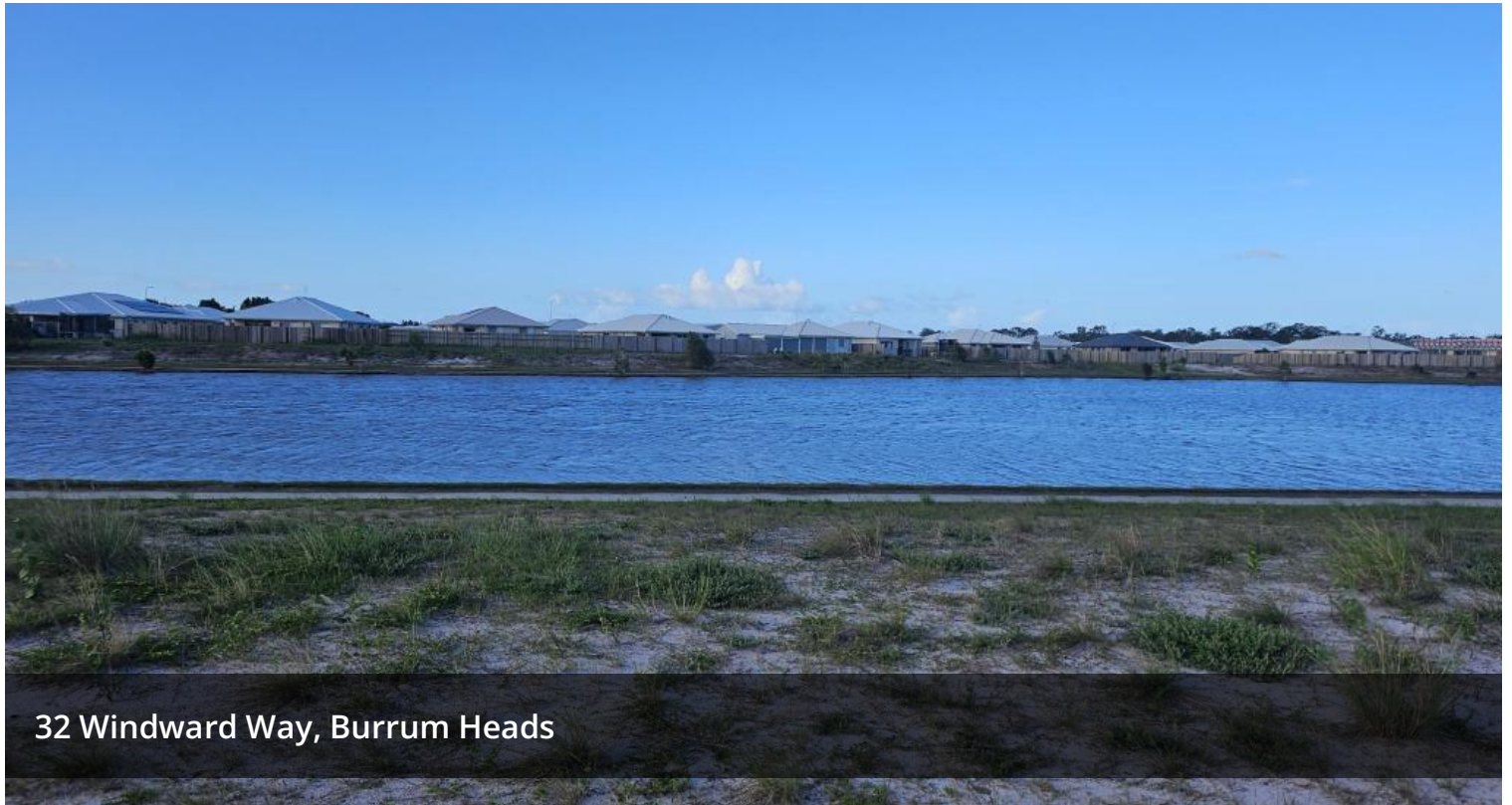
32 Windward Way, Burrum Heads