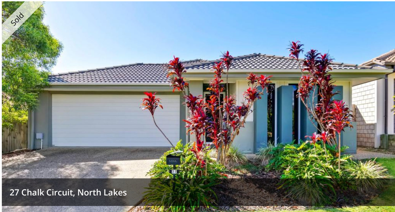
27 Chalk Circuit, North Lakes