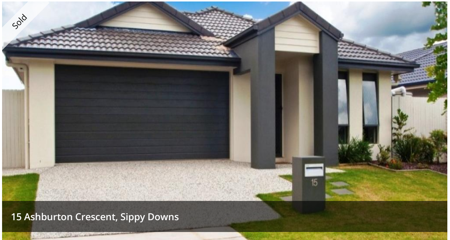
15 Ashburton Crescent, Sippy Downs