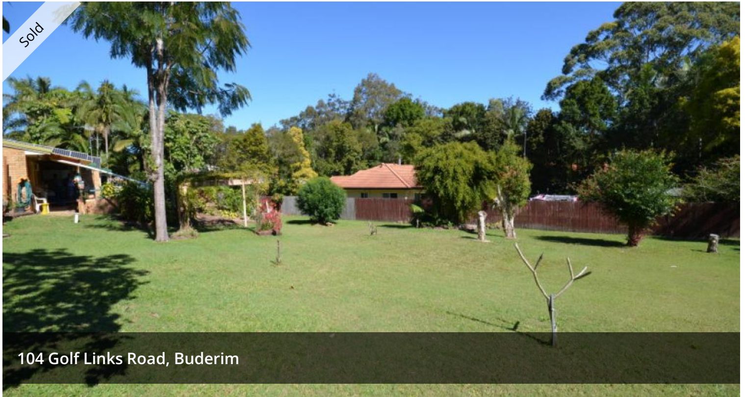
104 Golf Links Road, Buderim