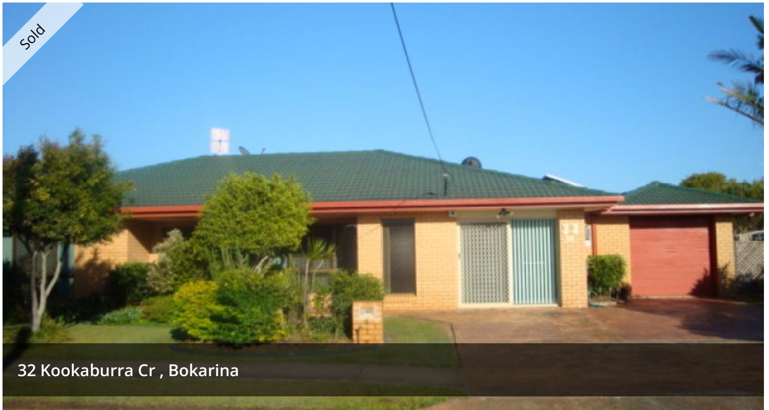
32 Kookaburra Cr , Bokarina