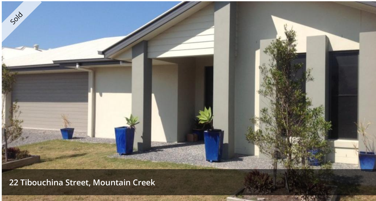
22 Tibouchina Street, Mountain Creek