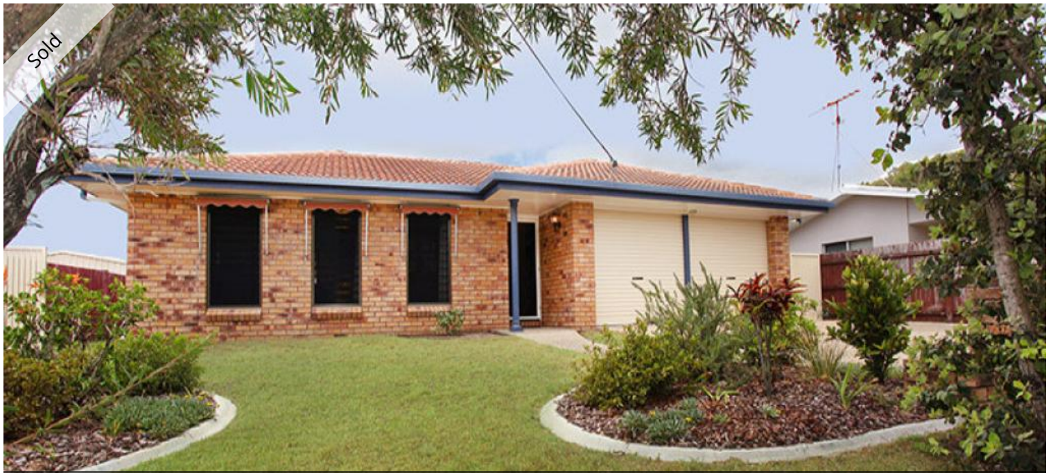
12 Kambora St, Warana