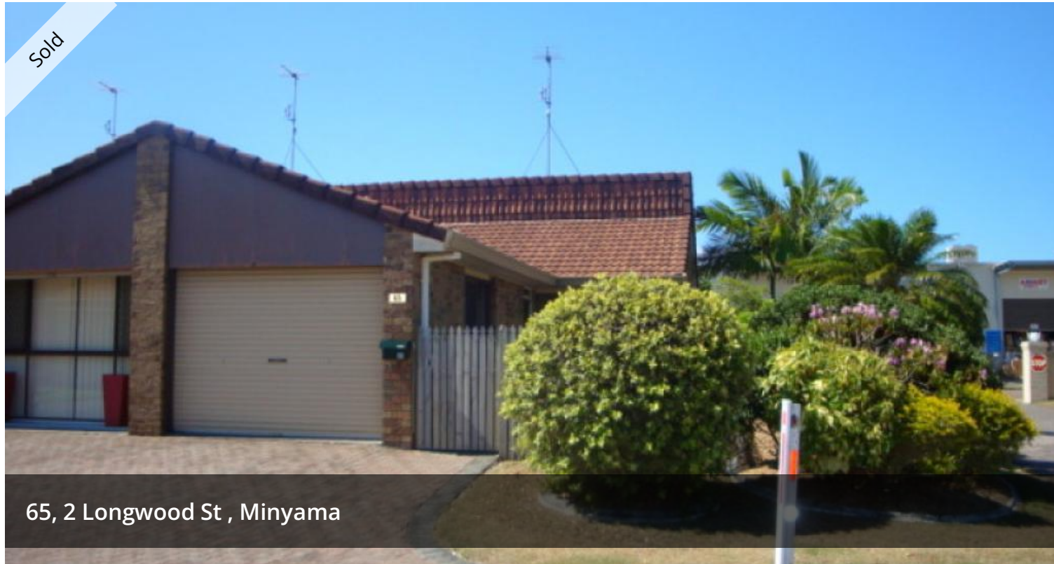
65, 2 Longwood St , Minyama