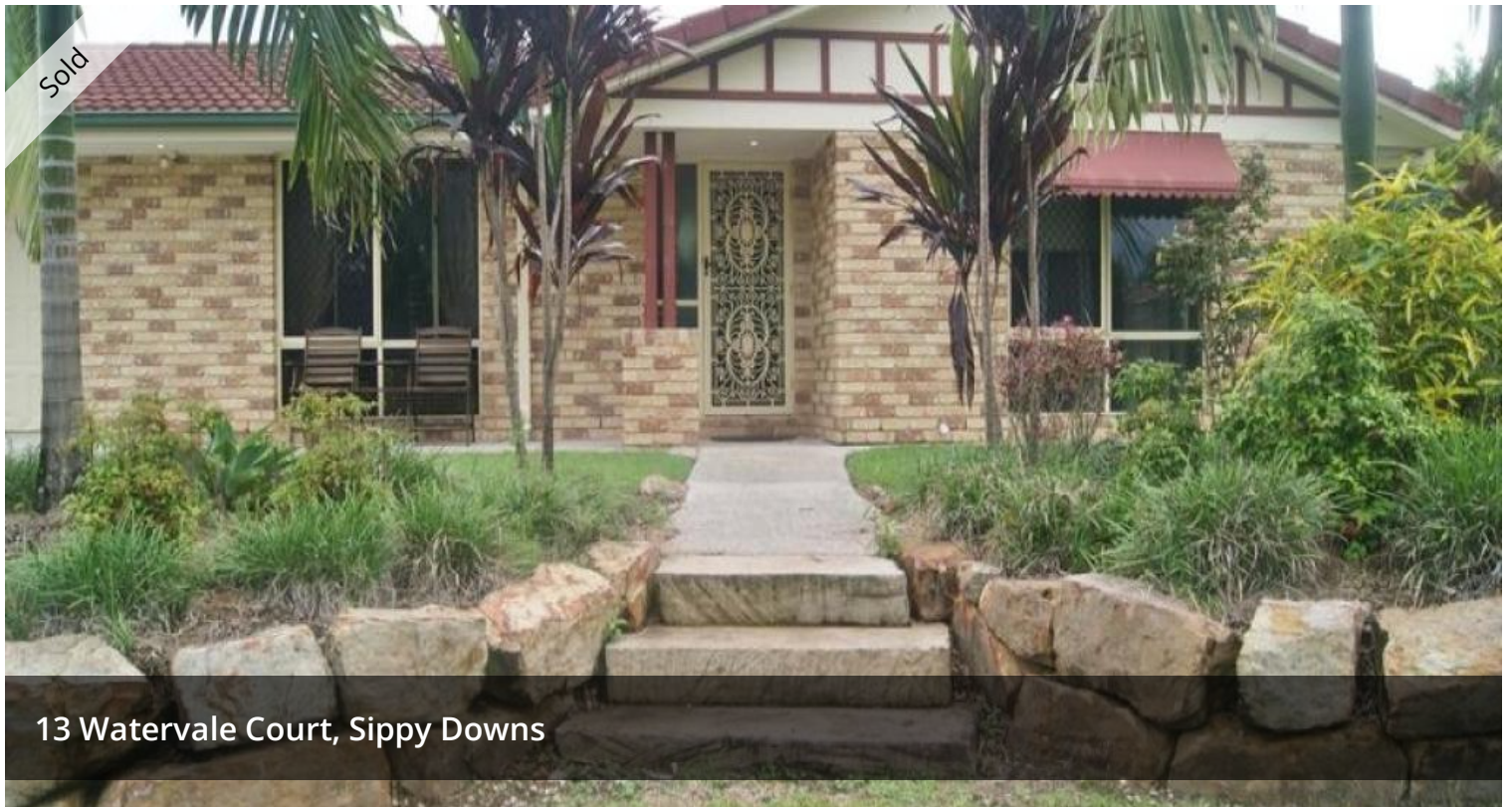
13 Watervale Court, Sippy Downs