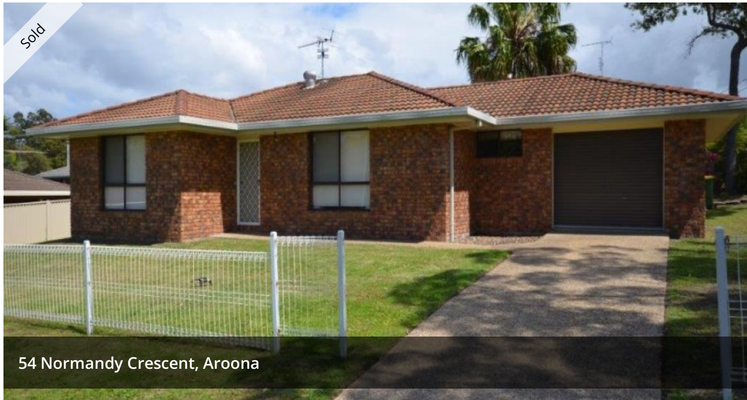
54 Normandy Crescent, Aroona