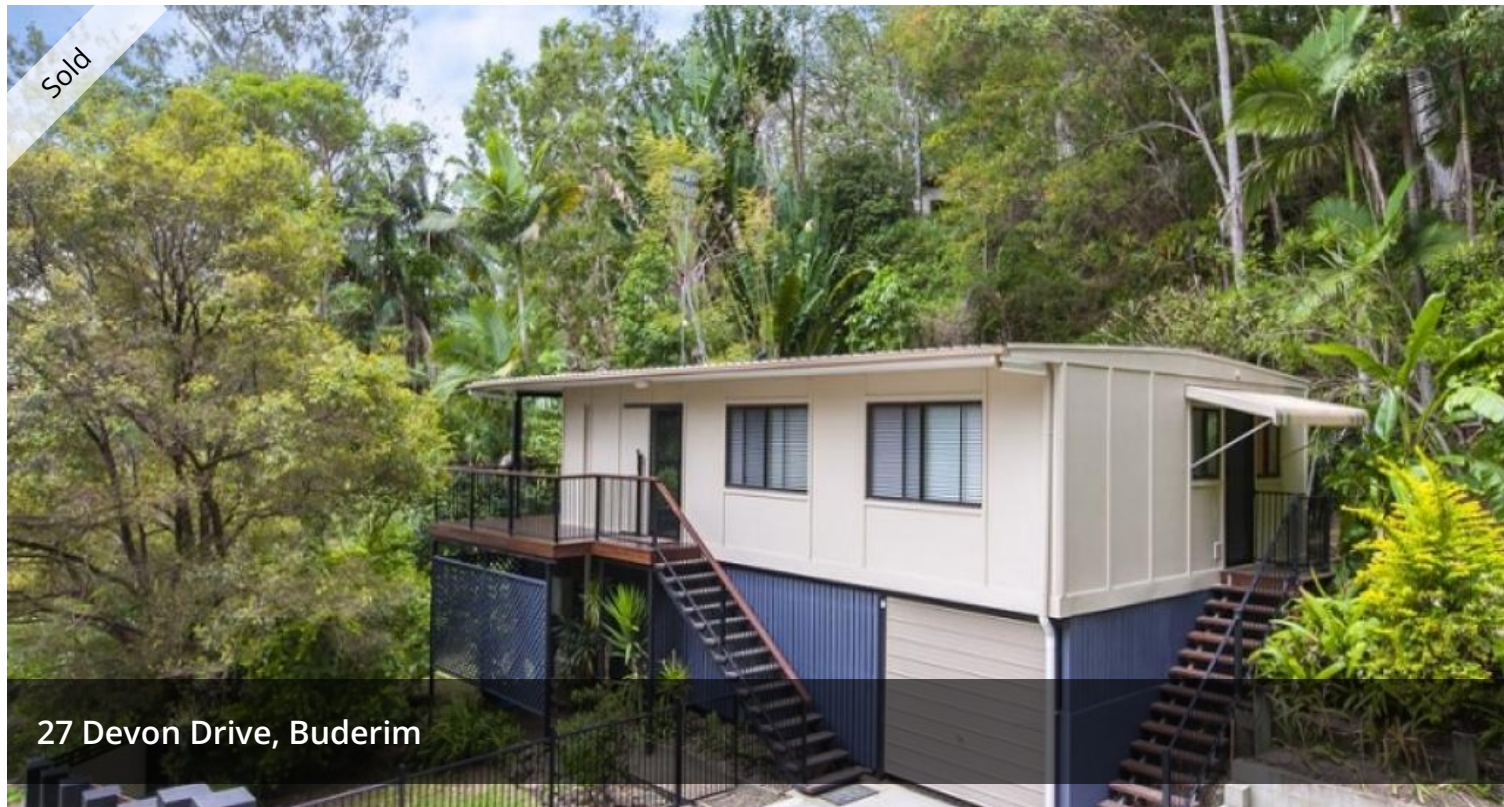
27 Devon Drive, Buderim