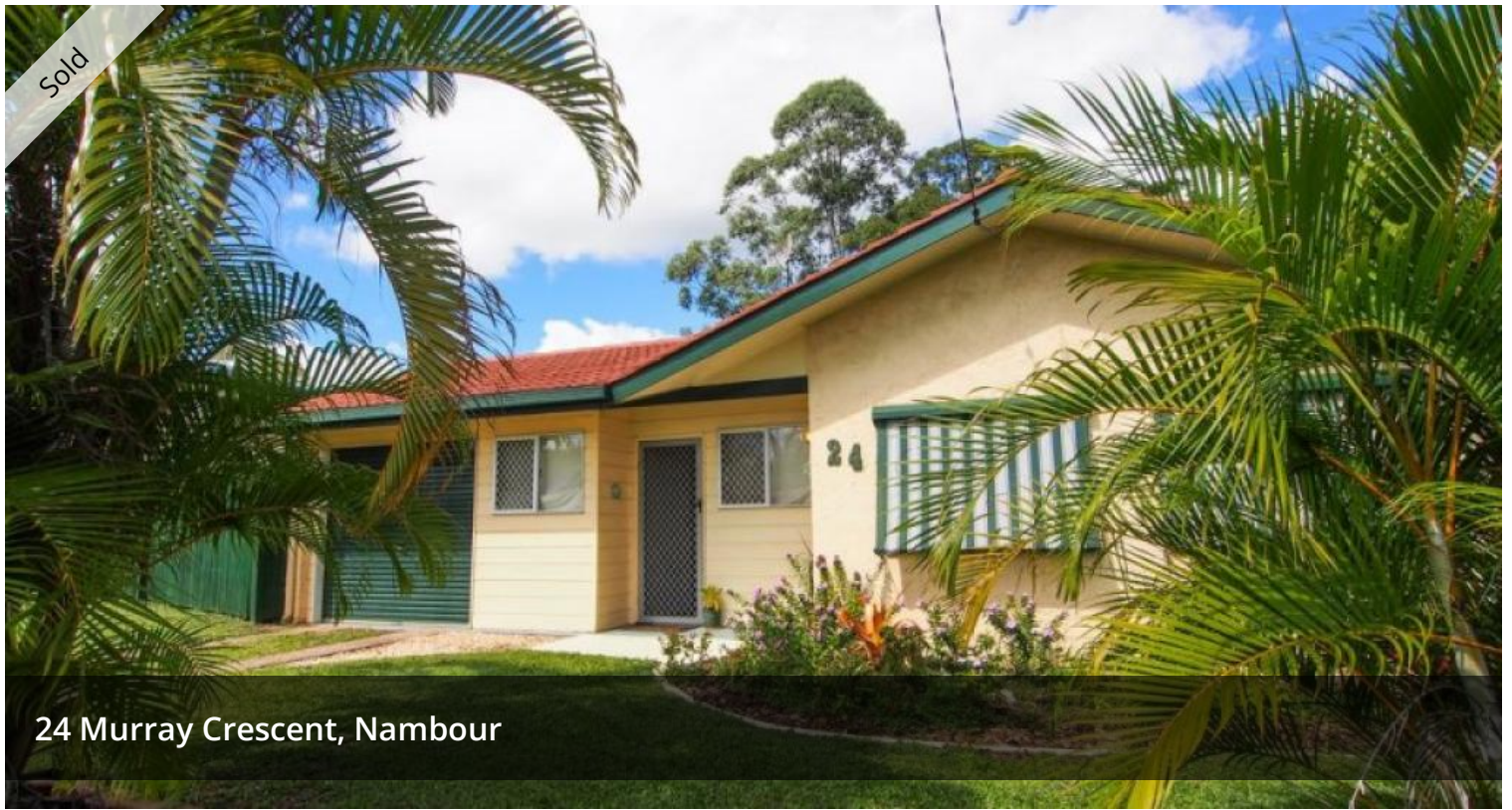
24 Murray Crescent, Nambour