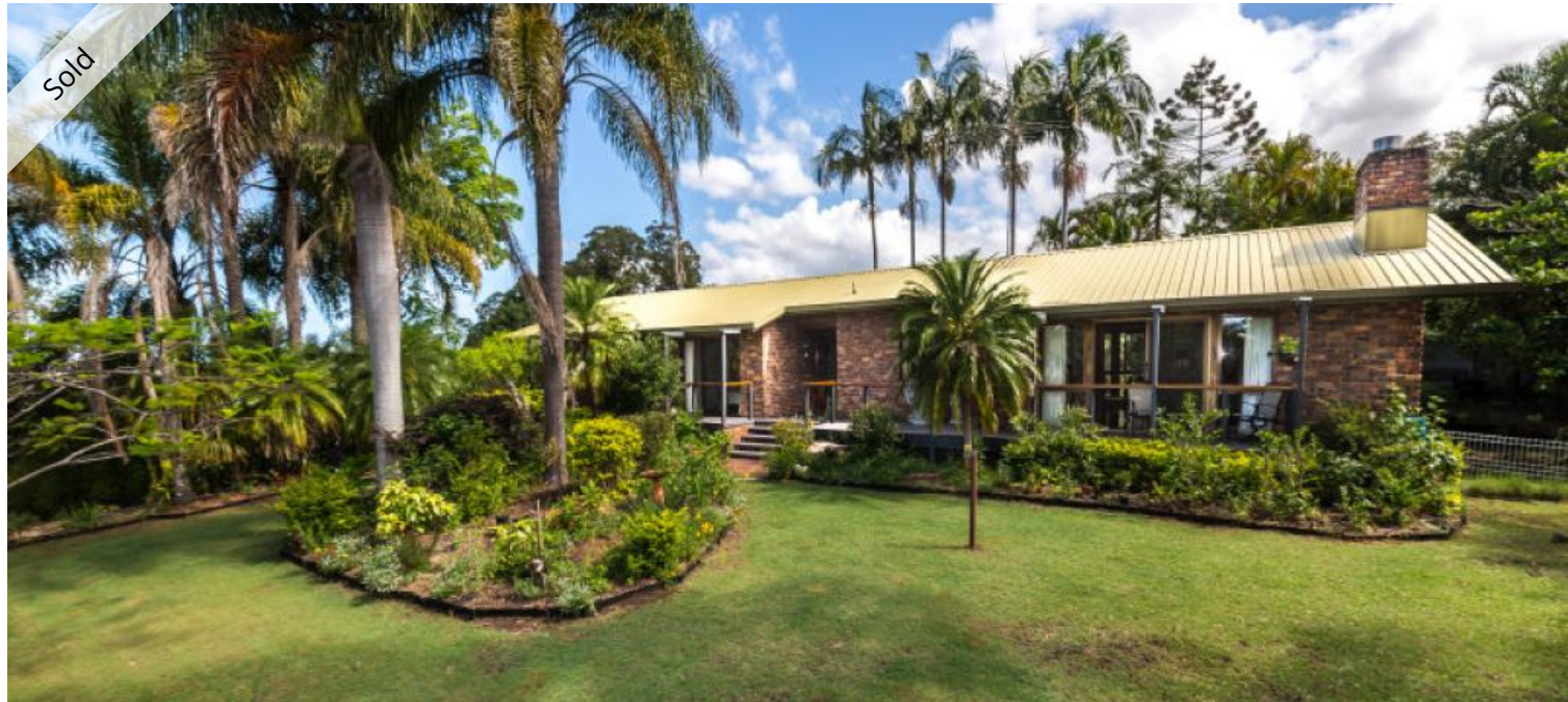
22-24 Mountain Breeze Court, West Woombye