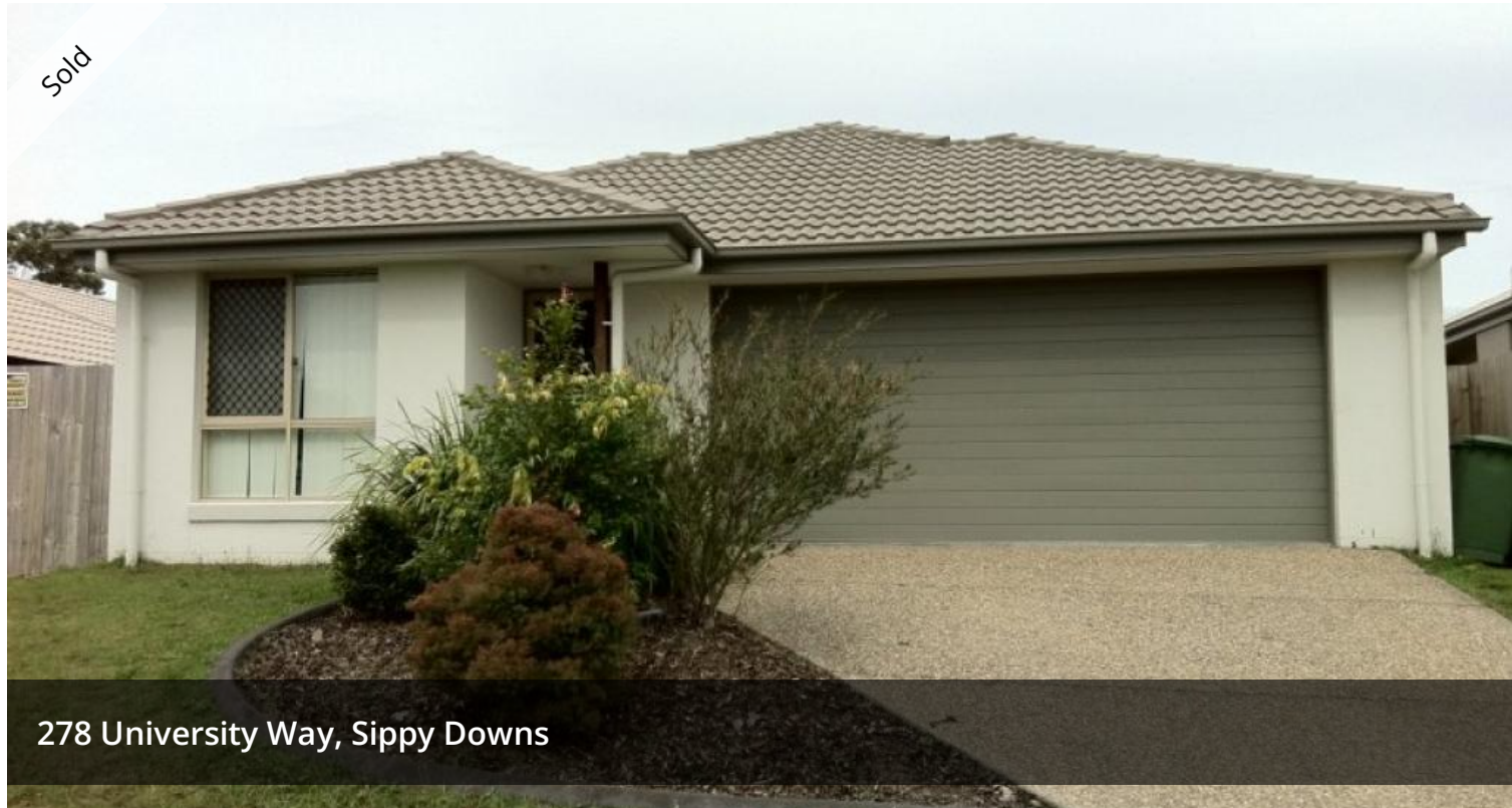
278 University Way, Sippy Downs