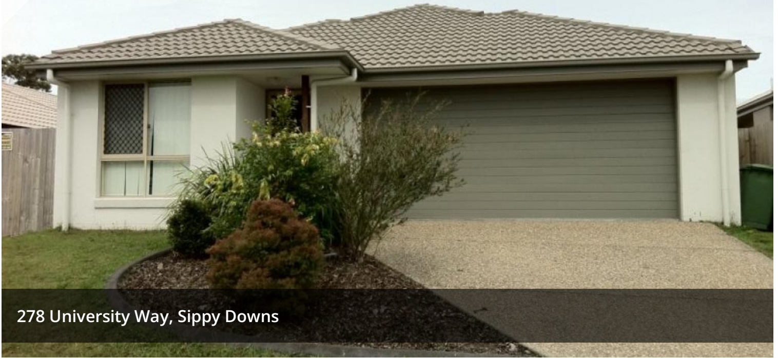
278 University Way, Sippy Downs