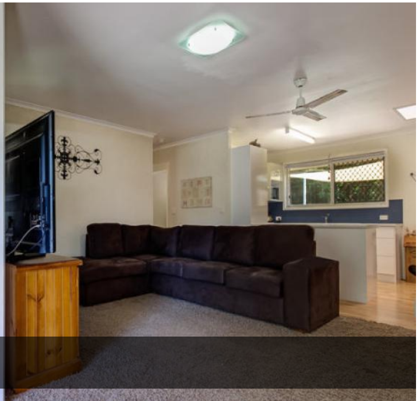
8 Titania Ct, Coes Creek