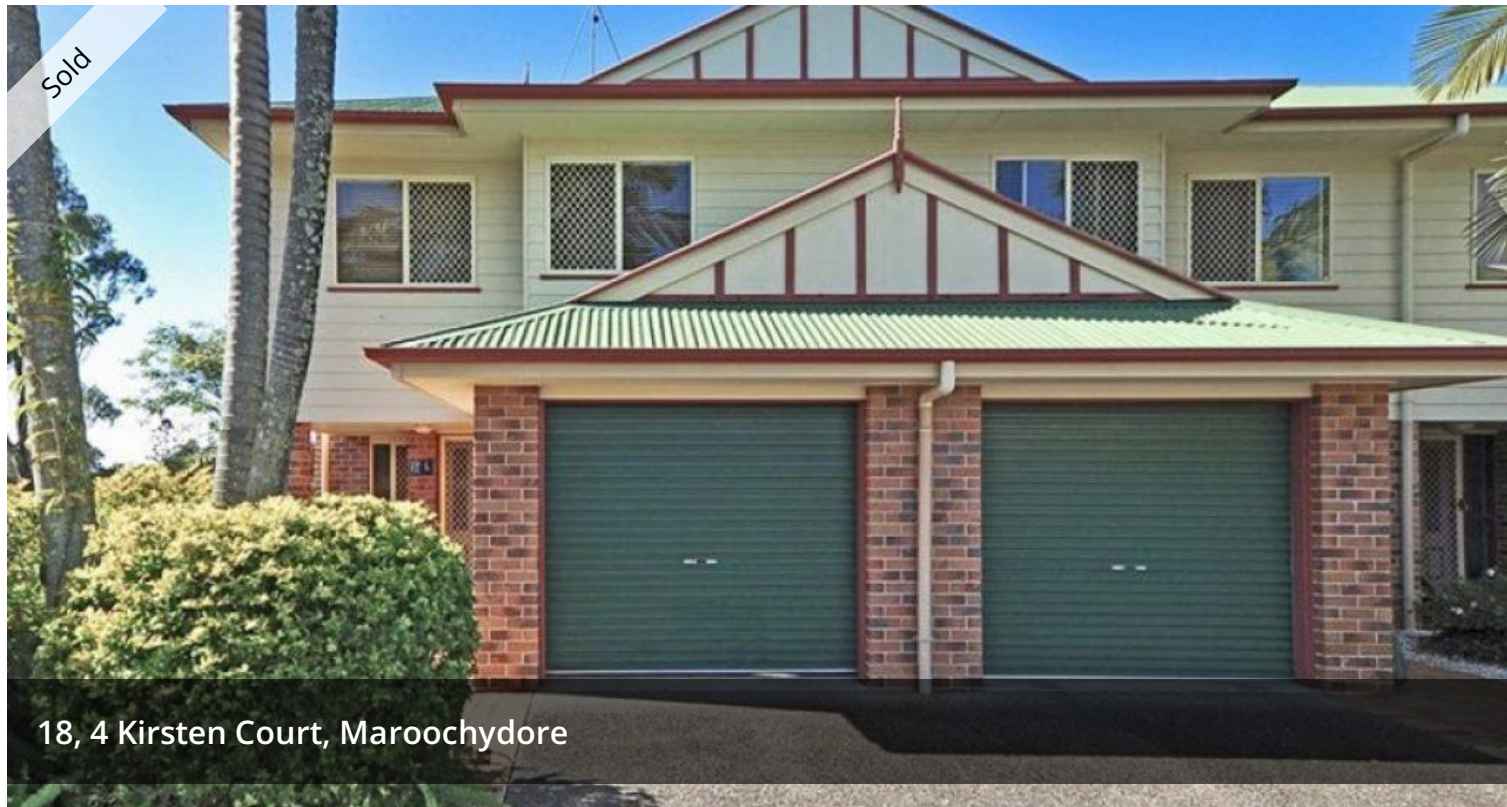
18, 4 Kirsten Court, Maroochydore