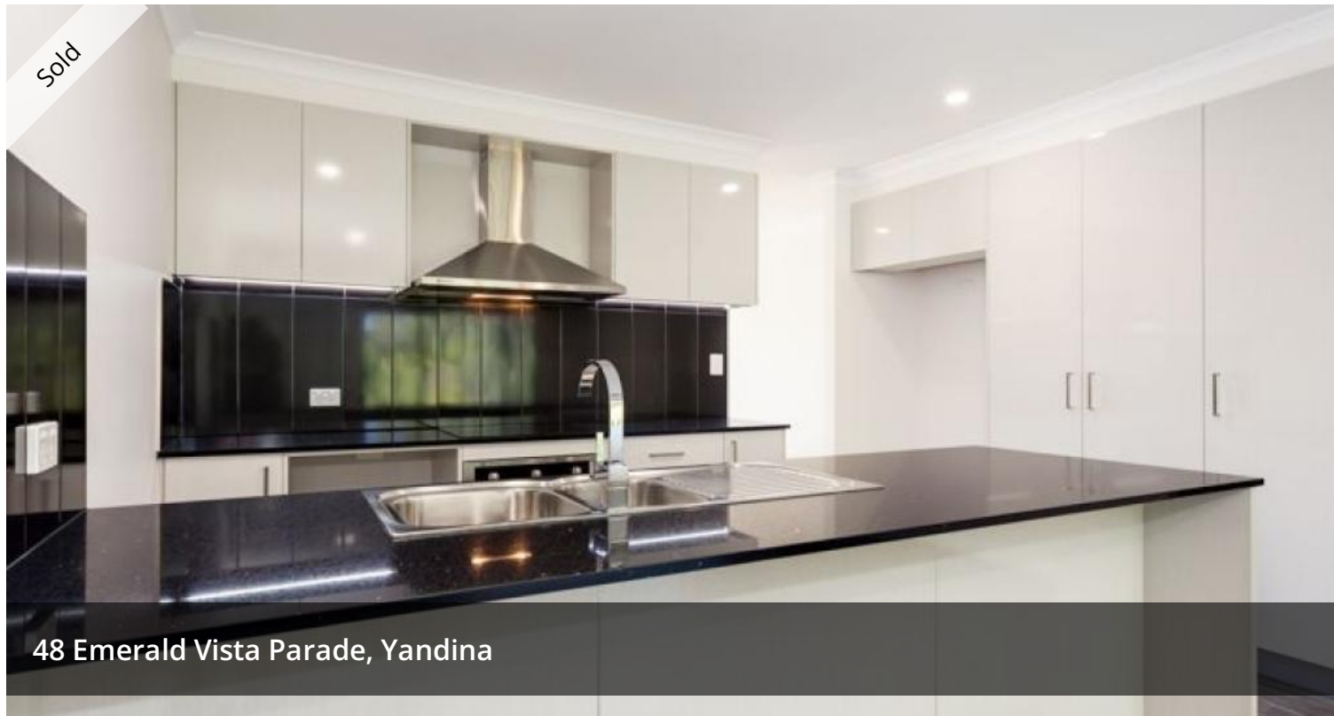
48 Emerald Vista Parade, Yandina