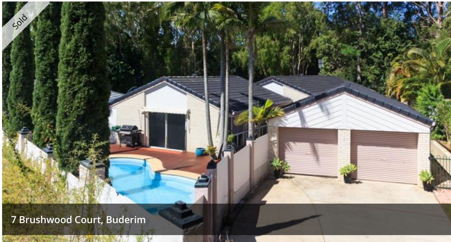
7 Brushwood Court, Buderim