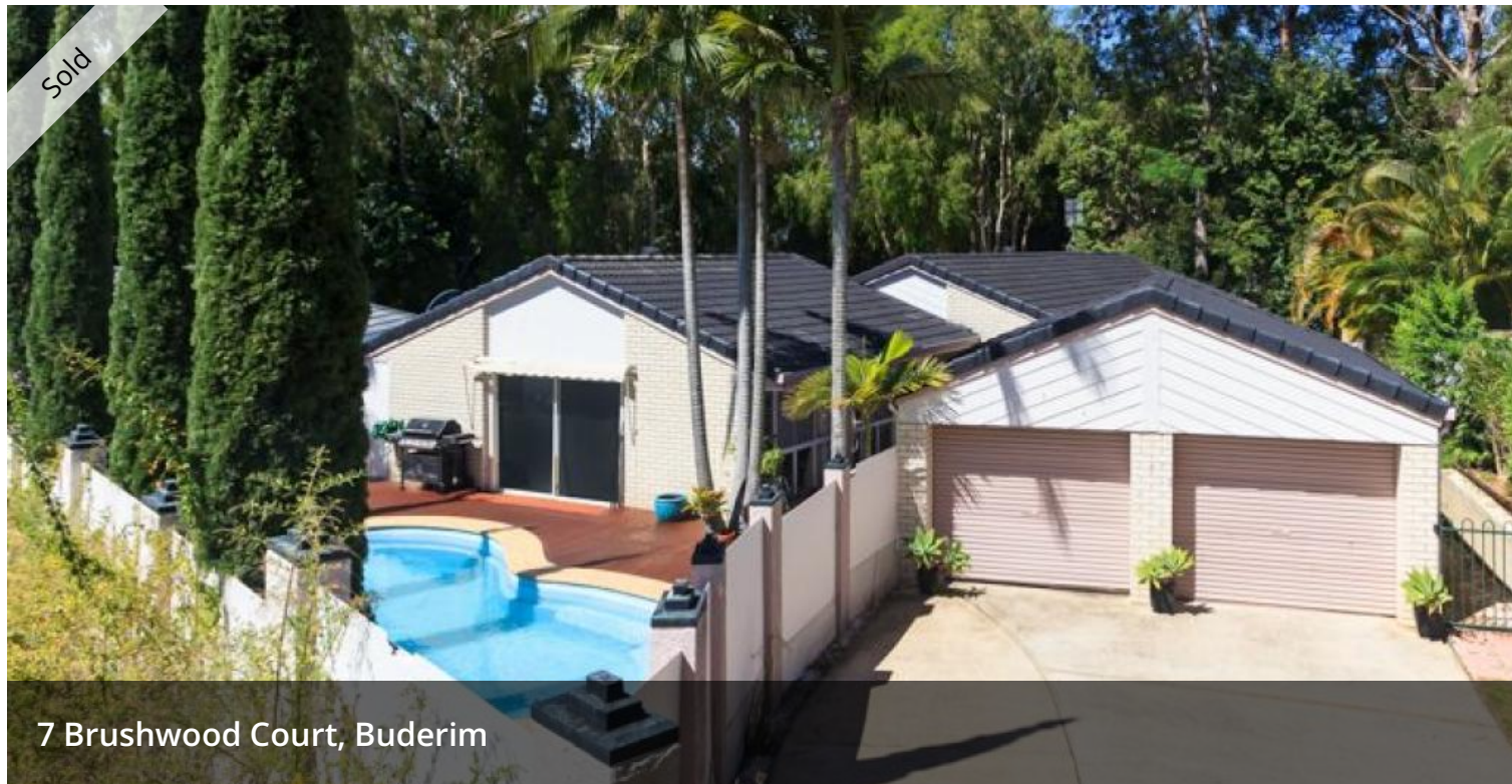
7 Brushwood Court, Buderim