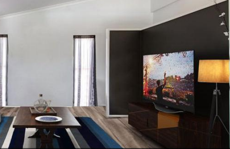
2 Longview Place, Woombye