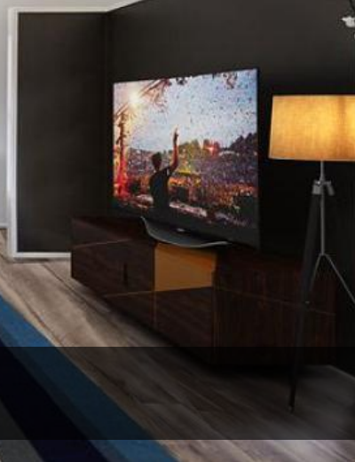
2 Longview Place, Woombye