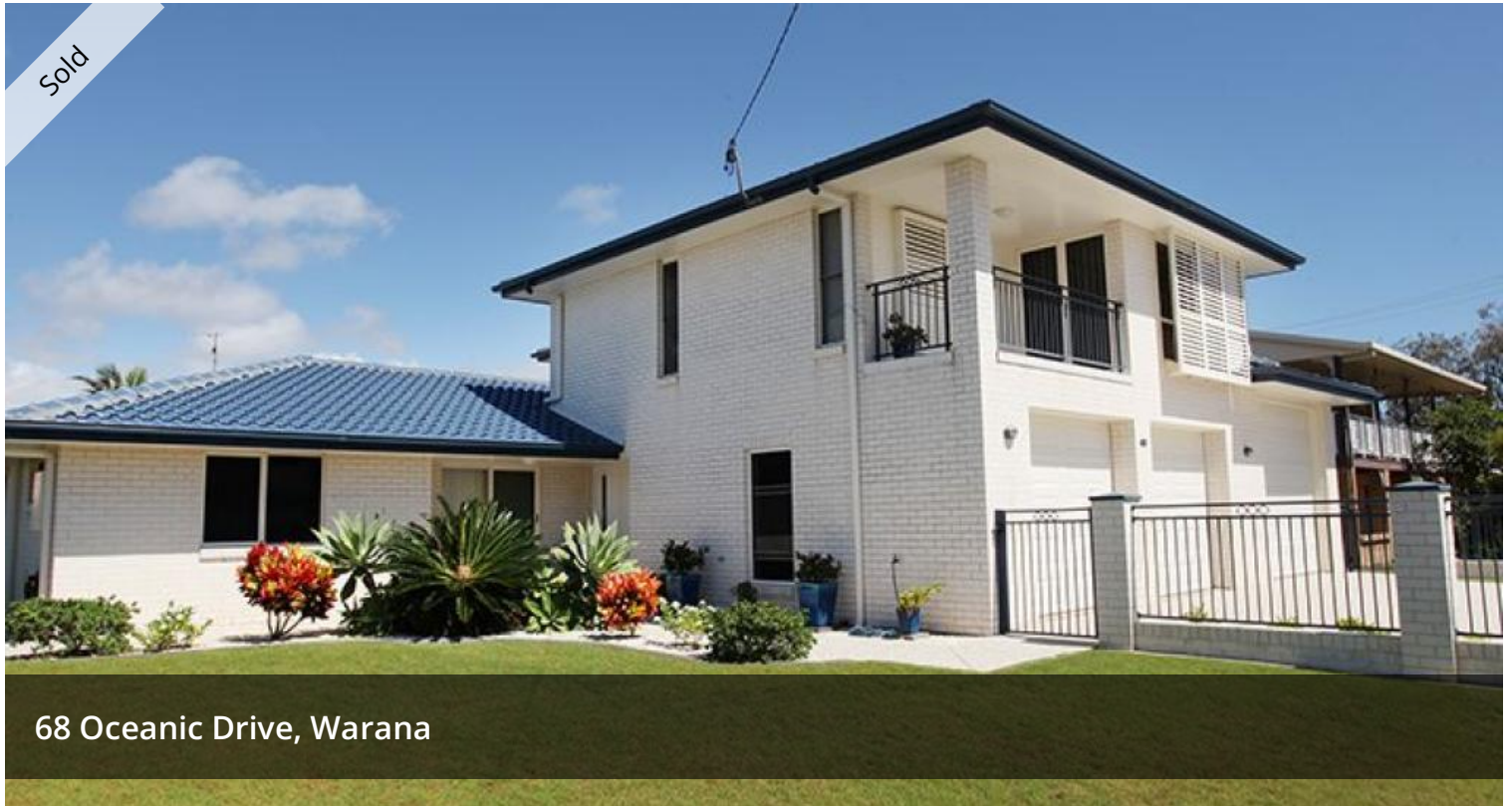
68 Oceanic Drive, Warana