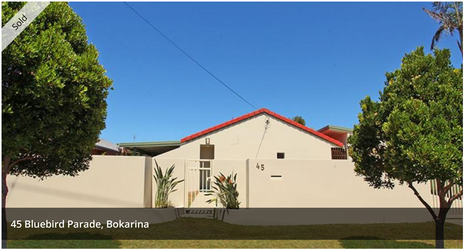
45 Bluebird Parade, Bokarina