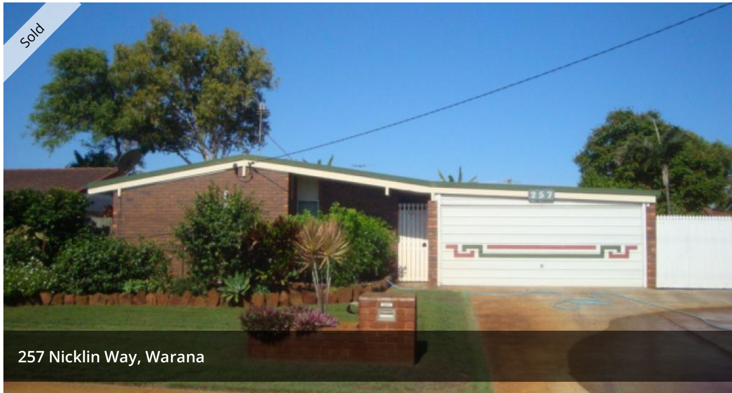
257 Nicklin Way, Warana