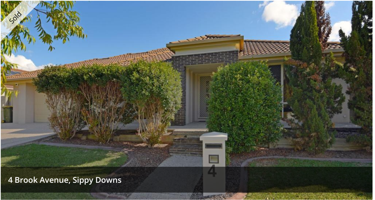
4 Brook Avenue, Sippy Downs