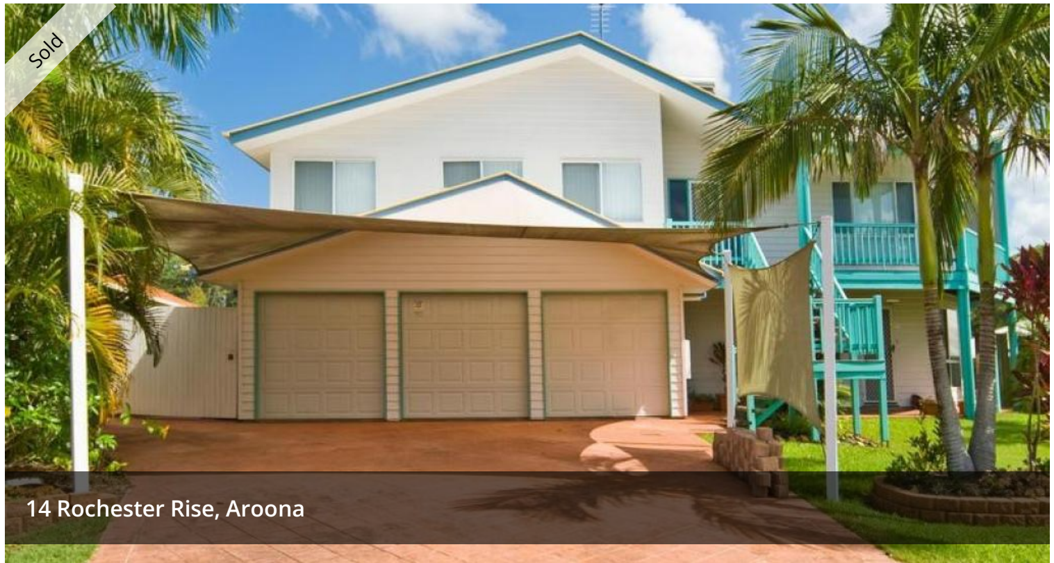
14 Rochester Rise, Arona